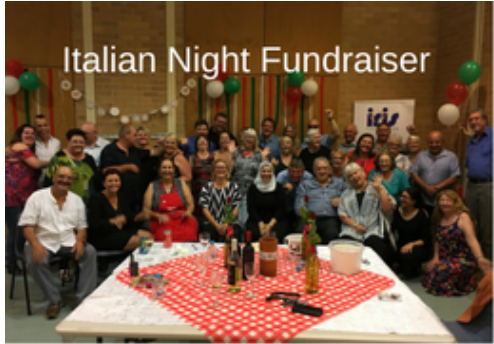
Italian Night Fundraiser