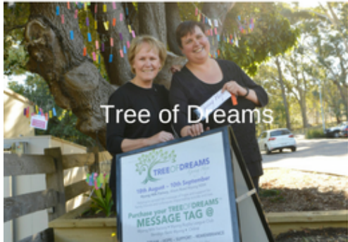
Tree of Dreams