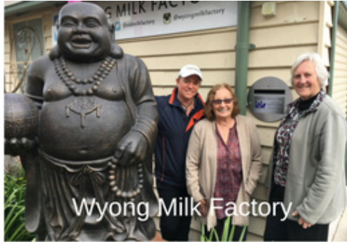
Wyong Milk Factory