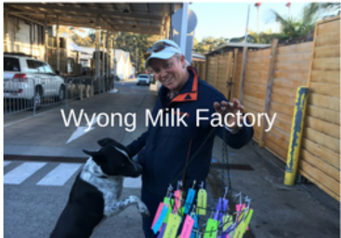
Wyong Milk Factory