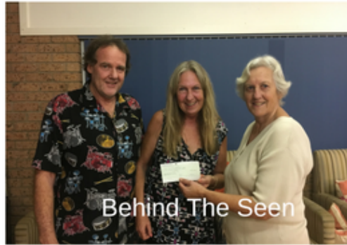
Behind The Seen