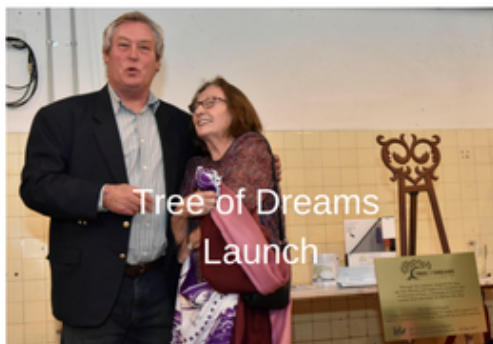
Tree of Dreams Launch