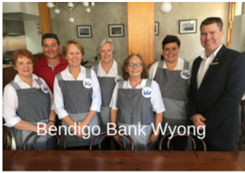
Bendigo Bank Wyong