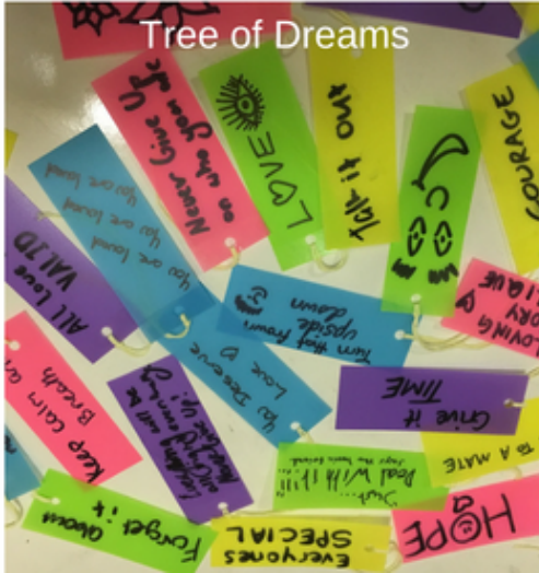
Tree of Dreams