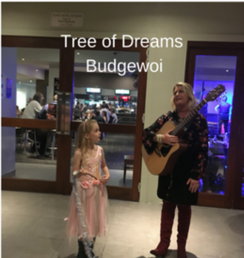
Tree of Dreams Budgewoi