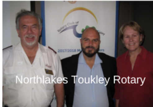
Northlakes Toukley Rotary