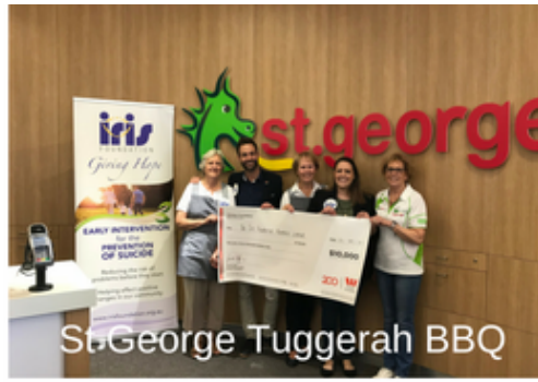
St George Tuggerah BBQ