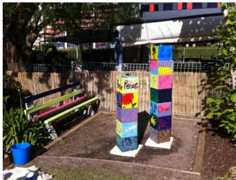
Totem poles created by participants of a We Care! Session

For further information about We Care! Email wecare4carers@gmail.com